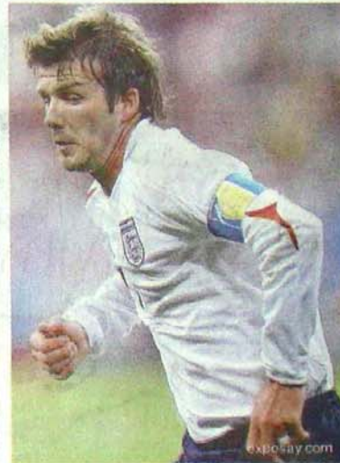
Soccer star David Beckham