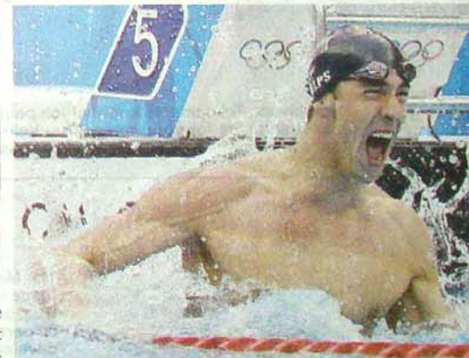
Record-breaking Olympian Michael Phelps

tan patch on it and a white patch on her sternum (breastbone). I have a sore throat and the beginning of a cold, so she put a tan patch on my throat and a white patch on my sternum.